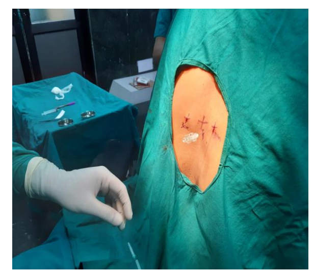
Figure 1: Landmark Guided Erector Spinae Plane Block