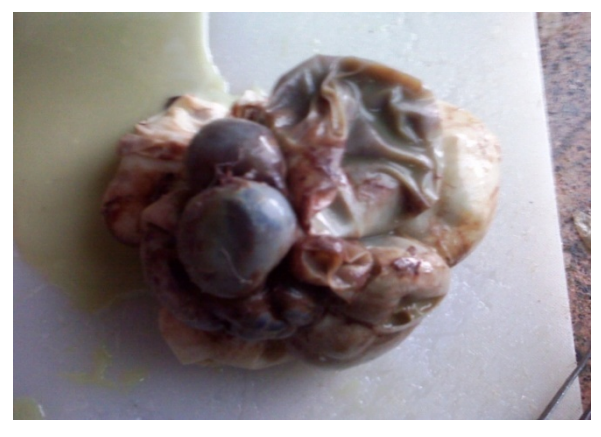
Fig 1: Multiloculated multicystic mass .on c/s yellowish white milky white fluid came

Histologically the cystic spaces were lined by a single layer of cuboidal to flat epithelium. At places the lining was attenuated. The stroma consist of loose fibrovascular tissue and smooth muscles with sparse chronic inflammatory cell infiltrate in the stroma at few places. So, histological diagnosis of mesenteric cyst lymphangioma was made.