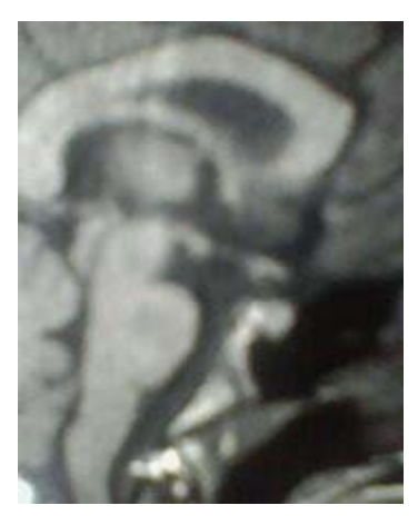
Fig 2: MRI brain T1 weighted, shows symmetrical hypointense lesion in central pons