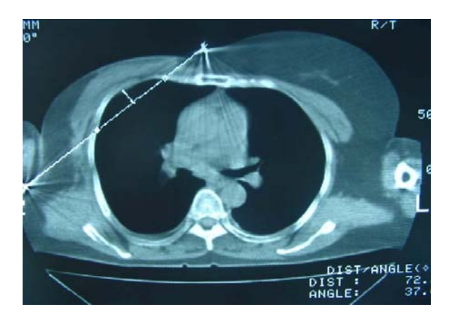
Fig 2: Central Lung Distance (CLD)