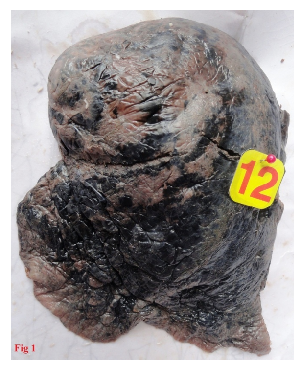
Fig 1- shows absence of fissures in left lung.