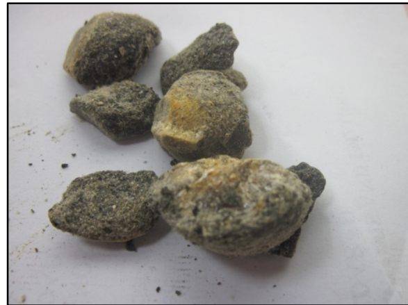
Figure 3: Fragments of impacted stone