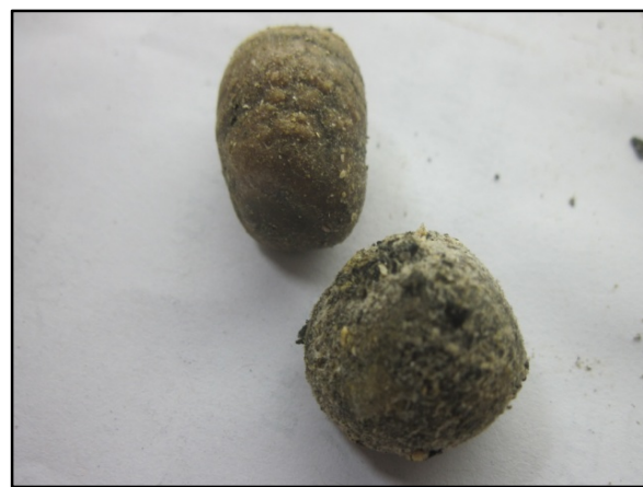
Figure 4: Other two milked out stones

Ultrasonography has been shown to be more helpful than plain films in diagnosing gallstone ileus. 5 They found that abdominal sonography demonstrated bowel loop dilatation (44.44%), extraluminal fluid (14.81%), ectopic stones (14.81%), gallbladder abnormalities (37.04%), and pneumobilia (55.56%).