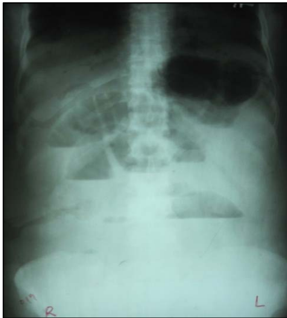
Figure 1 Abdominal radiograph in standing position

In this case, diagnosis of gall stone ileus was intra-operative.