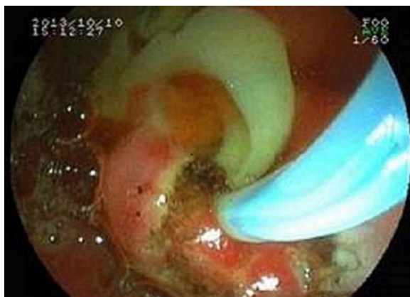
Figure 3: Germinative Membrane removed after endoscopic sphincterotomy