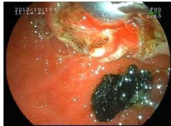
Figure 4: Bile-stained germinative membrane pieces dropped to the duodenum as a result of cleaning of the choledoc by means of basket and balloon