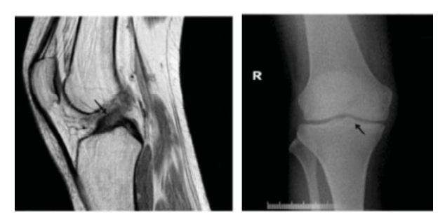
Fig. 1(a) MRI of a 24 year old male patient showing ACL strain revealing the abnormal contour of the ACL (arrow) and the corresponding AP view of plain radiograph is shown in Fig. 1(b) AP view of plain radiograph of a 24 year old male patient showing prominence of medial intercondylar eminence (arrow).