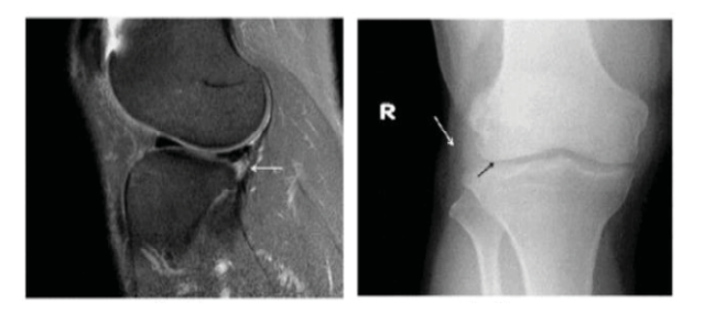
Fig. 2(a) MRI of 26 year old male patient showing grade III tear of lateral meniscus posterior horn (arrow) Fig. 2(b) The plain radiograph of 26 year old male patient showing grade III tear of lateral meniscus posterior horn on the MRI (Fig. 4(a)) shows decreased lateral tibio femoral joint space (black arrow), with indistinct lateral fat planes (white arrow)