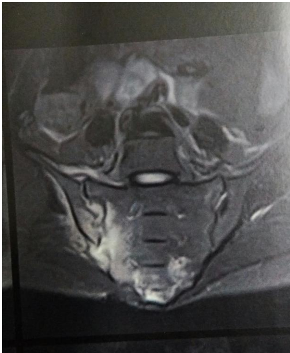
Figure 3- MRI picture of sacroiliitis

Hence there was septic focus detected. However sacroiliac joint did not yield any organism. Hence we decided to treat this case as a case of infectious sa-