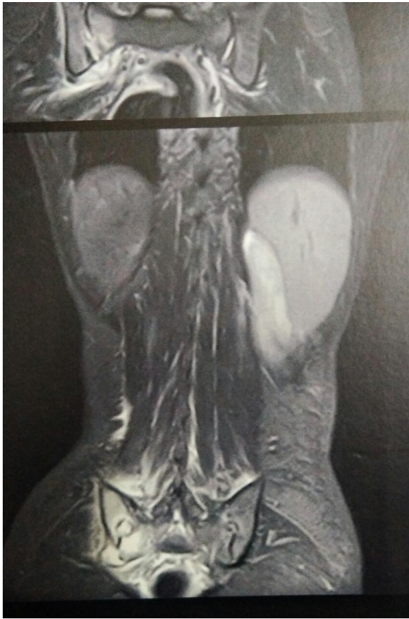
Figure 2- MRI picture of sacroiliitis